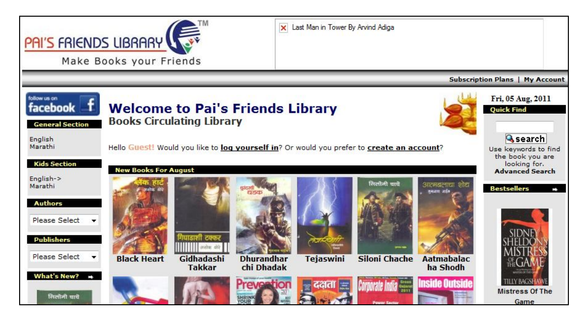
Figure-1: An online library of Pai's Friends Library (http://www.friendslibrary.in)