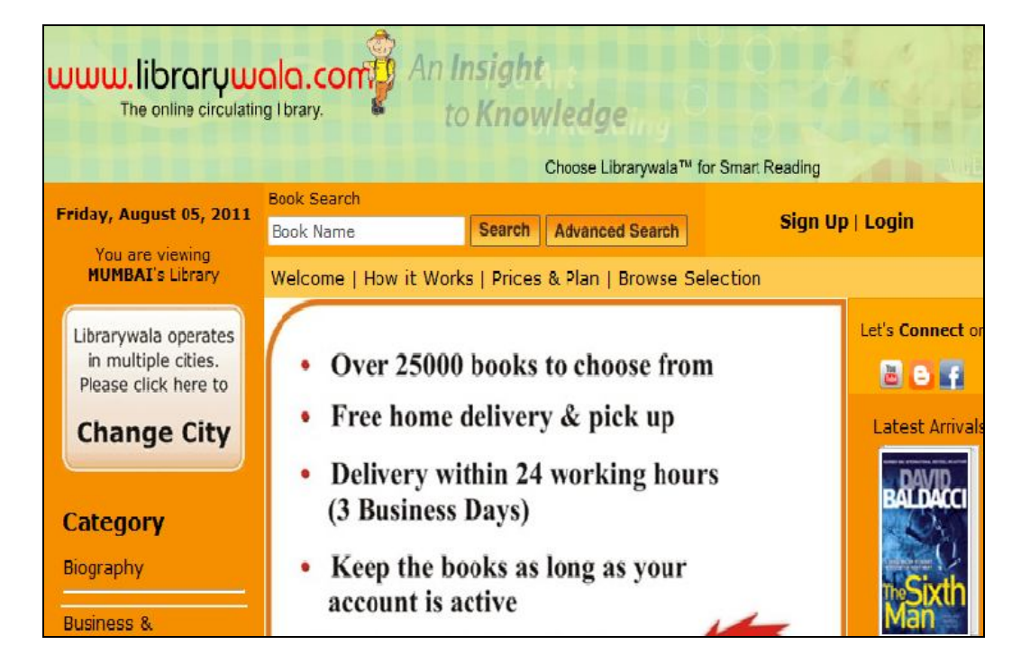
Figure-2: An online library initiative by DIPL(htpp://www.librarywala.com/)

Librarywala is offering members over 25,000 paperback books. Its members have been enjoying the highest commitment to customer service, satisfaction, and unmatched value.